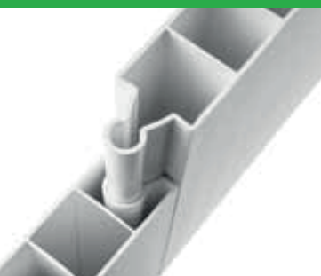
The click-in system